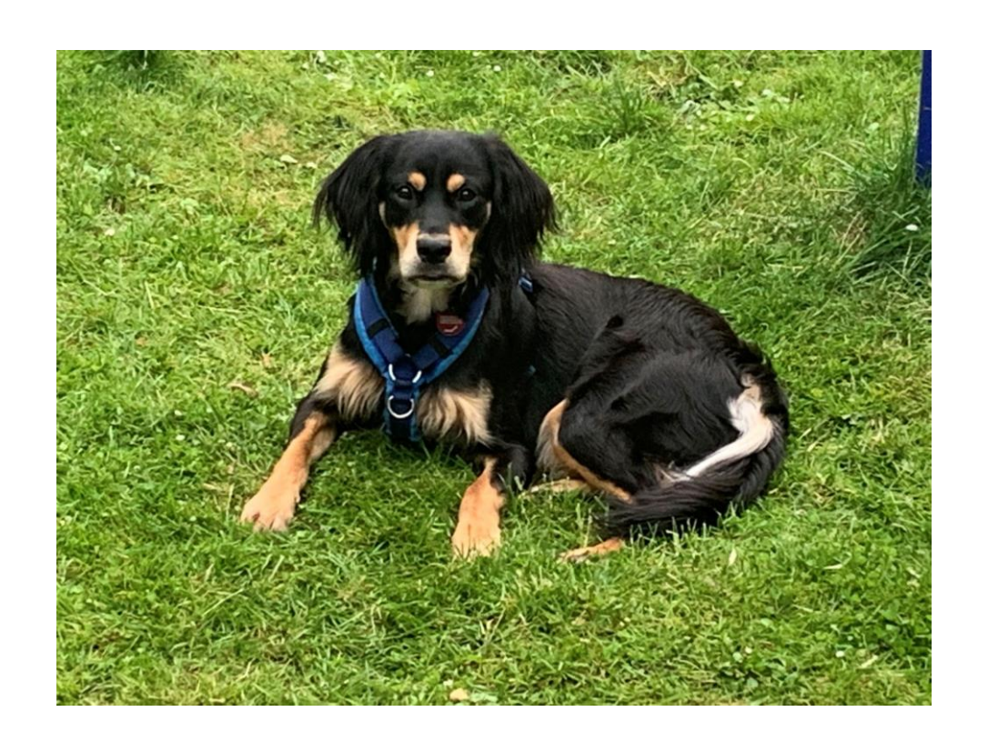
Reminder: Simba one year ago: